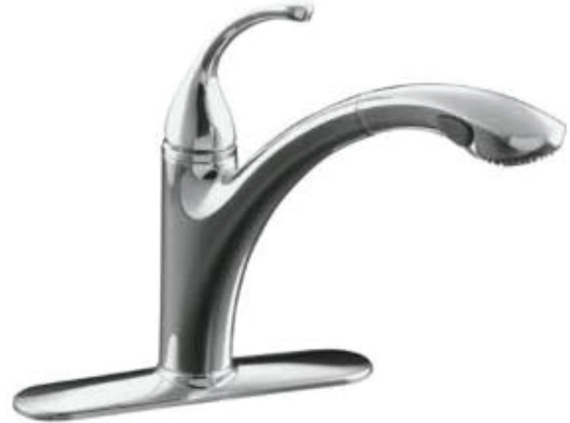
Forte single control pull out Kitchen sink faucet K10433-VS (shown in standard Chrome) Optional Finishes: Brushed Chrome & Brushed Nickel