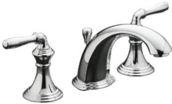
Devonshire lavatory faucet K394-4-CP (shown in standard Chrome)