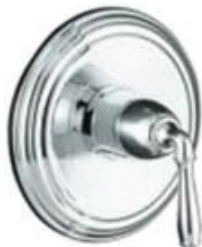
Devonshire Rite-Temp Pressure-balanced Shower faucet KT395-4-CP (shown in standard Chrome)